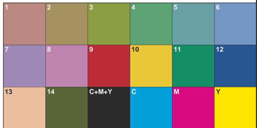
Picture 6: CIE-test colors (mixture colours) and basic colors for "Colour reproduction"