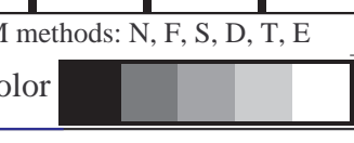
Figure B4 and/or D4 of the ISO/IEC-test charts; w^* - cmy^* ; w^* - olv(cmy)^* ; 16 visual equidistant steps of colour series: LAB^* \rightarrow \Delta LAB^* ; LM methods: N, F, S, D, T, E

Output linearization of 16 colour steps according to ISO/IEC 15775; PS operator cmy* setcmycolor