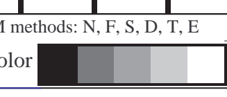
Figure B4 and/or D4 of the ISO/IEC-test charts; w^* - cmy^* ; w^* - olv(cmy)^* ; 16 visual equidistant steps of colour series: LAB^* \rightarrow \Delta LAB^* ; LM methods: N, F, S, D, T, E

Output linearization of 16 colour steps according to ISO/IEC 15775; PS operator cmyn* setcmykcolor