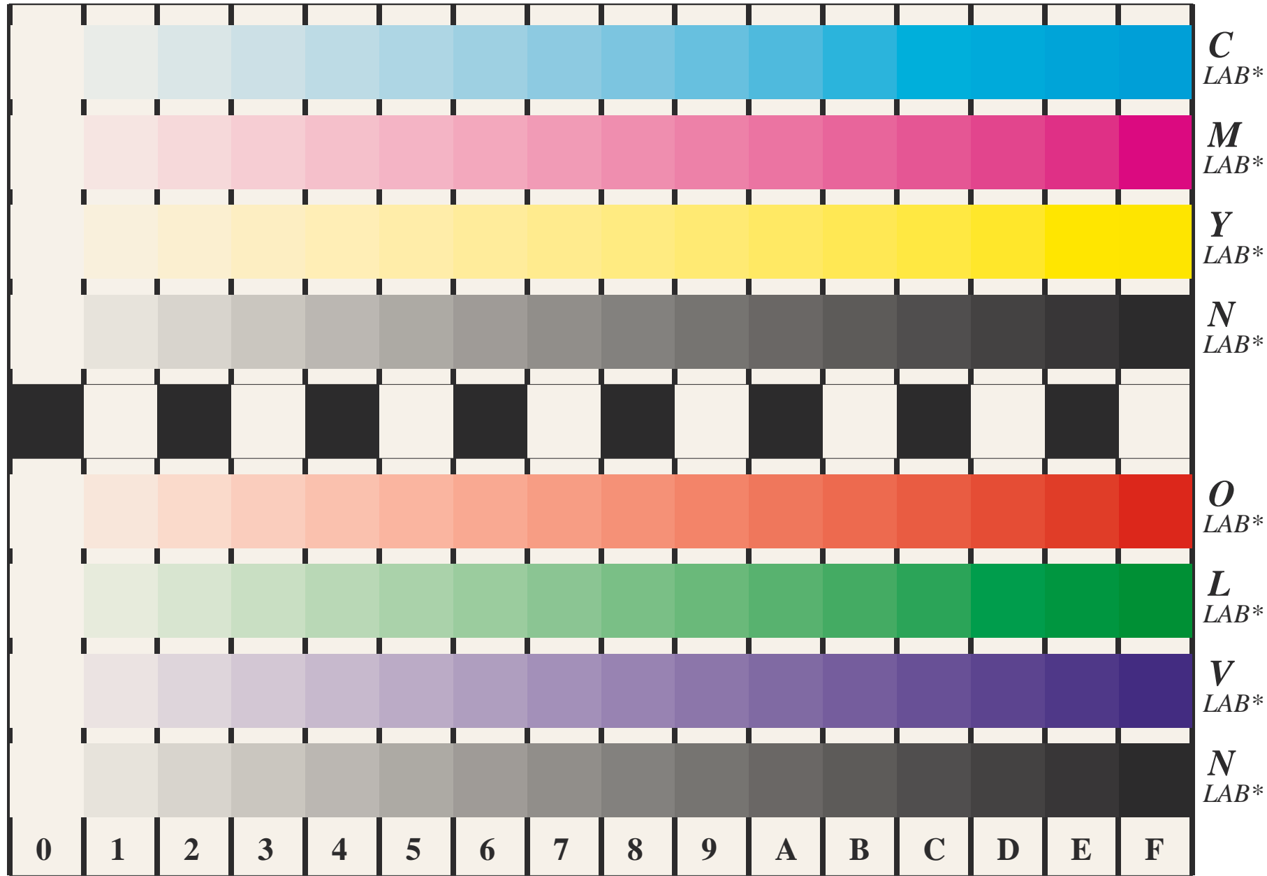
Figure B4 and D4 of the ISO/IEC-test charts no. 2 and 4; 16 visual equidistant steps of colour series; Use of the PS operator LAB*setcolor

BAM registration: 20030101-FE95/10L/L95E05FP.PS.PDF BAM material: code=tha4ta application for measurement of monitor (Yr=2.5) and printer output