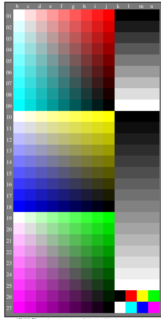
AE490-71 Part of test chart AE49 with 1080 colours; 9 or 16 step colour scales; data in column (b-n):rgb 1-100110-L0 cmy6*

Discriminability of chromatic colours Remarks: This test uses many colour scales of 9 steps Hue plane Red - Cyan blue (rows 01 to 09, column b to j) Discriminability of 81 chromatic colours Are all the 81 colours different? Yes/No Only in case of "No": How many are different? Of the 81 are ..... different Hue plane Yellow - Blue (rows 10 to 18, column b to j) Discriminability of 81 chromatic colours Are all the 81 colours different? Yes/No Only in case of "No": How many are different? Of the 81 are ..... different Hue plane Green - Magenta red (rows 19 to 27, column b to j) Discriminability of 81 chromatic colours Are all the 81 colours different? Yes/No Only in case of "No": How many are different? Of the 81 are ..... different Result: Of the 243 (=3x81) colours are ..... different Artifacts, please describe if visible: ..... ..... Remarks about the creation and content of the PDF files: Sometimes "colour smoothing" is a default setting. In this case the 9 steps are often not visible and may be counted as one step. Sometimes "optimizing the PDF output for the web" is a default setting. For example this setting may reduce the 1080 colours on a page to 256 colours.