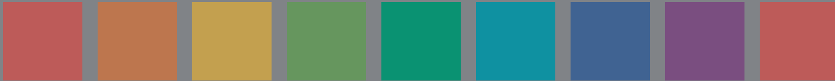
10: R00Y_075_050* e 11: R50Y_075_050* e 12: Y00G_075_050* e 13: Y50G_075_050* e 14: G00B_075_050* e 15: G50B_075_050* e 16: B00R_075_050* e 17: B50R_075_050* e 18=01: R00Y_075_050* e