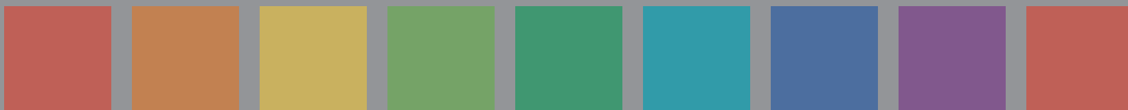
10: R00Y_075_050_e 11: R50Y_075_050_e 12: Y00G_075_050_e 13: Y50G_075_050_e 14: G00B_075_050_e 15: G50B_075_050_e 16: B00R_075_050_e 17: B50R_075_050_e 18=01: R00Y_075_050_e