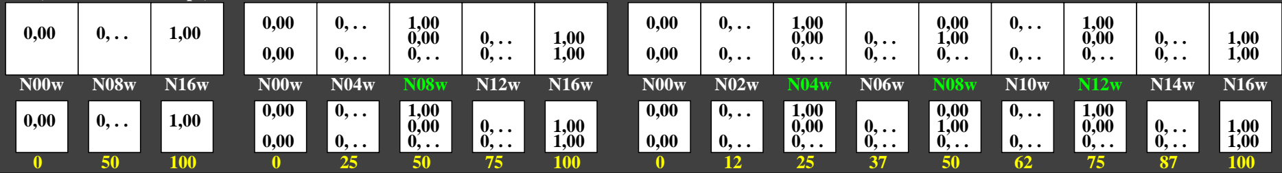
gel40-5n, Test samples: 3, 5 and 9 colour steps, greu=0,500, expu=2,000, expa=2,000