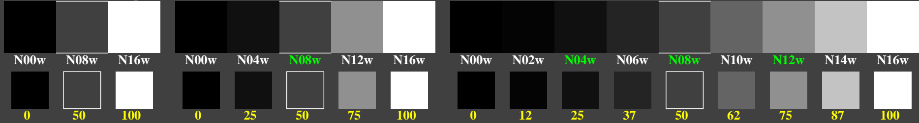
gel40-1n, Test samples: 3, 5 and 9 colour steps, greu=0,500, expu=2,000, expa=2,000