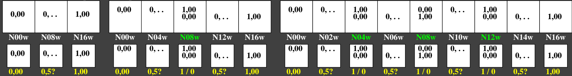
gel40-3n, Test samples: 3, 5 and 9 colour steps, greu=0,500, expu=2,000, expa=2,000