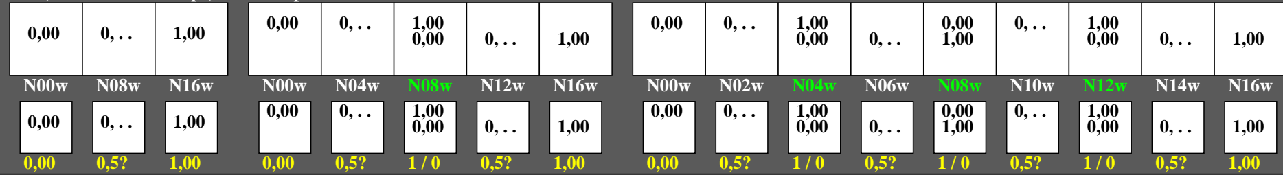
gel60-3n, Test samples: 3, 5 and 9 colour steps, greu=0.500, expu=1.500, expa=1.500