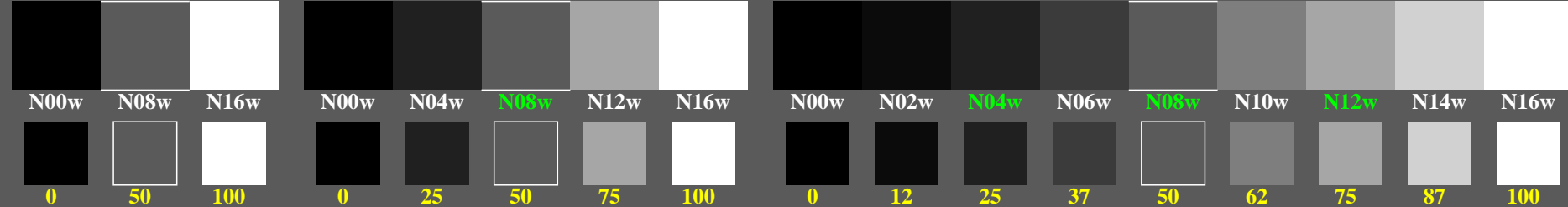
gel60-1n, Test samples: 3, 5 and 9 colour steps, greu=0.500, expu=1.500, expa=1.500