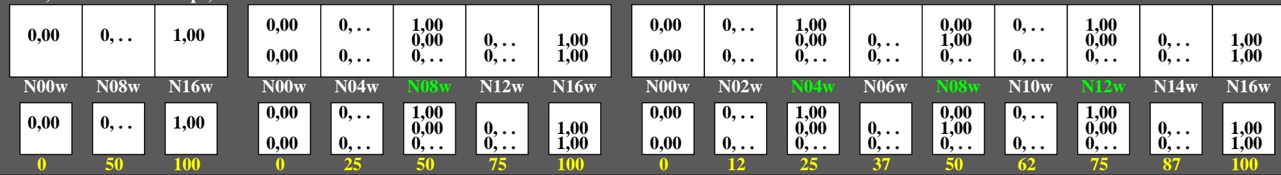
gel60-5n, Test samples: 3, 5 and 9 colour steps, greu=0.500, expu=1.500, expa=1.500