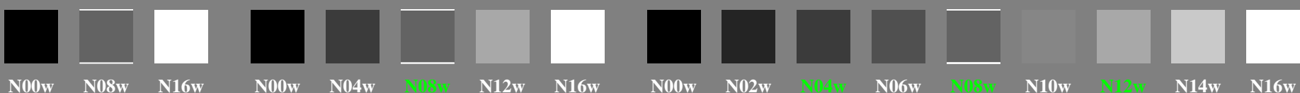
heg40-7n, Test samples: 3, 5 and 9 colour steps, greu=0.500, expu=1.000, expa=1.000, expi=1.000

r: 0, 108, 270, 435, 600, 710, 820, 928, 1000 i: 0, 143, 230, 314, 390, 524, 658, 787, 1000 Black N00w – Black N16w = White W L^*_{TUBLOG,U} = [50/\log(5)] \log(Y/Y_U) + 50, Y_N=4, Y_U=20, Y_W=100