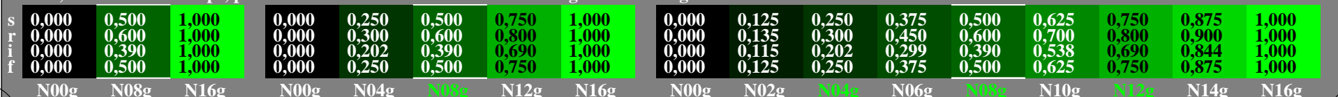
heh70-7n, Test samples: 3, 5 and 9 colour steps, greu=0.500, expu=1.000, expa=1.000, expi=1.000

Three, 5 and 9 colour steps, produced visual linearization r: 0, 135, 300, 450, 600, 700, 800, 900, 1000 i: 0, 115, 202, 299, 390, 538, 690, 844, 1000 L^*_{TUBLOG,U}=[50/\log(5)] \log(Y/Y_U)+50, Y_N=4, Y_U=20, Y_W=100 Black N00g – Black N16g = Green G